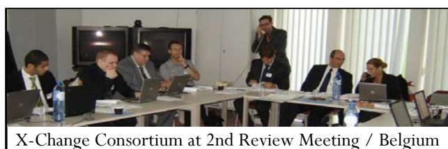
X-Change Consortium at 2nd Review Meeting / Belgium

follow, and all essential information have been given.